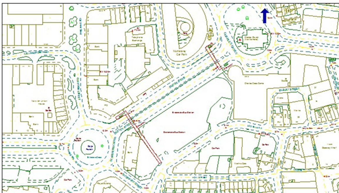
Plymouth City Council Licence No. 100018633 Published 2016 Scale 1:2500